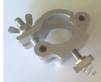
4900.MC Stainless Steel Unistrut channel nut, bolt and pipe clamp, for pipes 1.5" (38mm) to 2" (50mm) OD. Four required per enclosure.