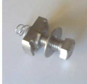
4900.MB Stainless Steel Unistrut channel nut, bolt and washer. Four required per enclosure.

Two parallel 1 5/8" x 13/16" Unistrut. Mount with suitable standard Unistrut hardware, or order 4 sets per enclosure of either of the following Tempest mounting kits. Tempest kits are made from stainless steel and aluminum hardware.