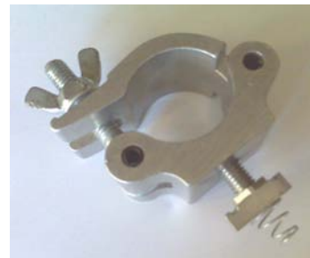
4900.MC Stainless Steel Unistrut channel nut, bolt and pipe clamp, for pipes 1.5" (38mm) to 2" (50mm) OD. Four required per enclosure.