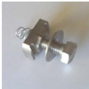
4900.MB Stainless Steel Unistrut channel nut, bolt and washer. Four required per enclosure.

Two parallel 1 5/8" x 13/16" Unistrut. Mount with suitable standard Unistrut hardware, or order 4 sets per enclosure of either of the following Tempest mounting kits. Tempest kits are made from stainless steel and aluminum hardware.